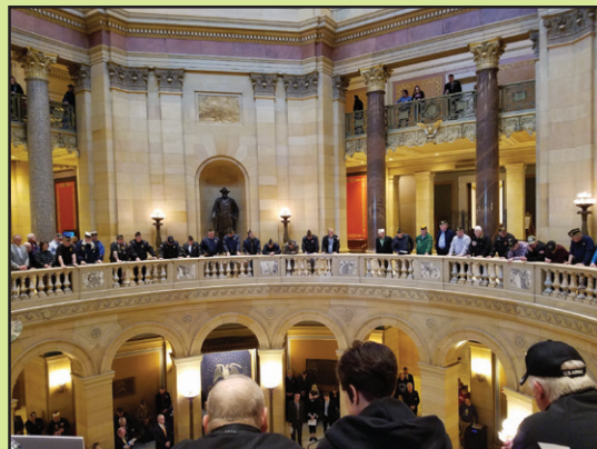
Veterans and spectators watching the various speakers during the Veterans on the Hill ceremony.