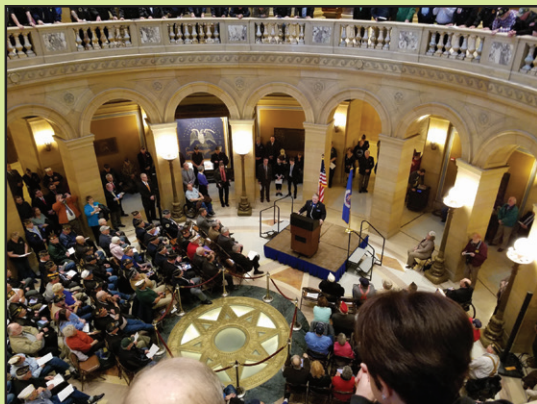
Opening ceremonies in the Capitol rotunda.