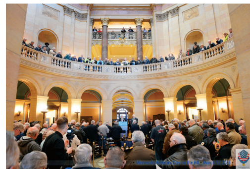
The upper levels were lined with Veterans and families during the opening program as well.

As can be seen from the pictures, we had a very good turnout from Veterans from all over the State for the Veterans on the Hill day this year. Our bus picked up Veterans and their spouses from the Bemidji Walmart (28), Kabakona Corners (1), the former Akeley VFW (3) and at the truck stop in Motely (6). Of the 58 Veterans and Spouses originally signed up, several of them from Crookston, Park Rapids and Brainard got together and opted to carpool from their respective areas, so we ended up with 38 people making the bus trip with us to St Paul. The ride down to St Paul was abuzz with conversations about the various topics to be discussed with our Representatives and members of the different Committees dealing with Veterans issues.