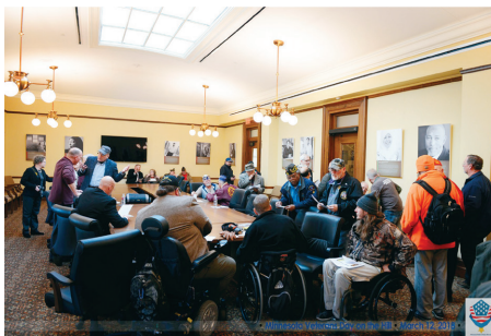
One of the several meeting rooms where we able to meet with our Representatives after the opening ceremonies.

Donations from the Bemidji American Legion and VFW Posts, DAV Chapters #38(Park Rapids) and #22(Brainard), the Minnesota Am Vets and the Minnesota DAV Foundation covered the cost of the bus ($1500) and the Bemidji DAV Chapter #7 covered the cost of the great buffet lunch at the Golden Corral in Maple Grove on the way home ($455.75). Coffee, doughnuts and water were provided for morning snacks, along with a donation of 4 dozen assorted muffins from Raphael's Bakery & Cafe in Bemidji.