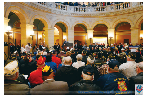
In the Capitol Rotunda during the opening and greeting ceremonies.