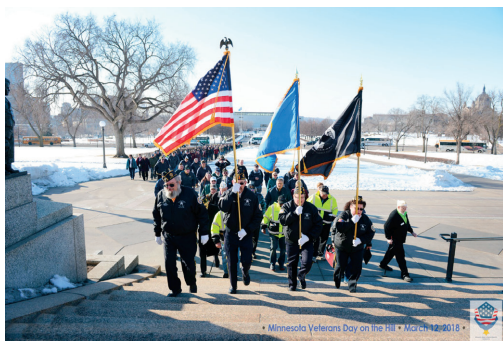
Marching up to the Capitol from the Veterans Administration Building.