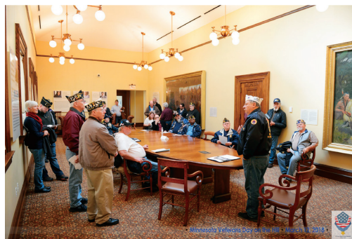
One of the other meeting rooms waiting for the Representatives from their Districts to arrive.